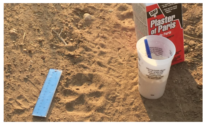
Figure 5. Plaster of Paris can be used to make simple plaster casts of wolf tracks which aid in identification of individual animals.

Wolf territoriality is expressed via scent marks that include scat, urine, and ground scratching (Figure 7). Mature, dominant wolves exhibit scent-marking behavior, primarily at the edge of their territories and near rendezvous sites. Setting up track traps or camera traps at these locations provides an additional opportunity for monitoring for wolf presence.