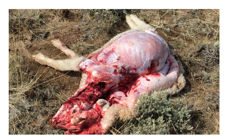
Figure 9. A field necropsy on dead livestock can help determine the cause of death. The collection of blood around bite marks indicates the prey was alive at the time of the bite.