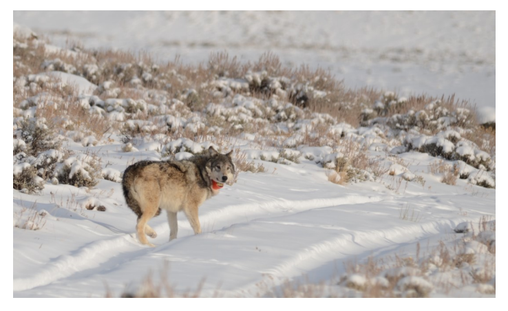
Figure 13. Monitoring data can be used by federal or state agency personnel to select appropriate locations for live trapping and radio collaring wolves.

One of the main benefits of monitoring data is that it can be used to guide future livestock protection and wildlife damage management plans and actions. For example,