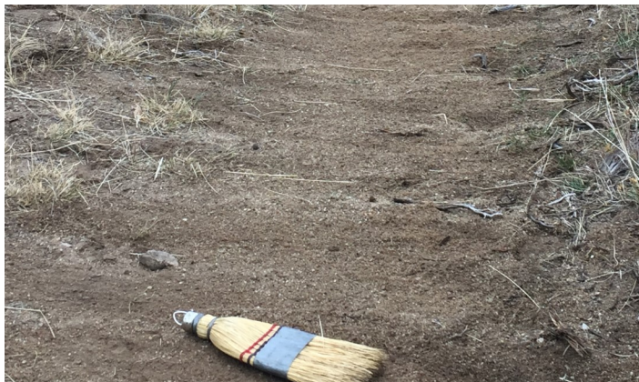
Figure 4. Track "traps" are made by clearing a section of dusty/sandy ground of all tracks using a broom, rake, or sifter.