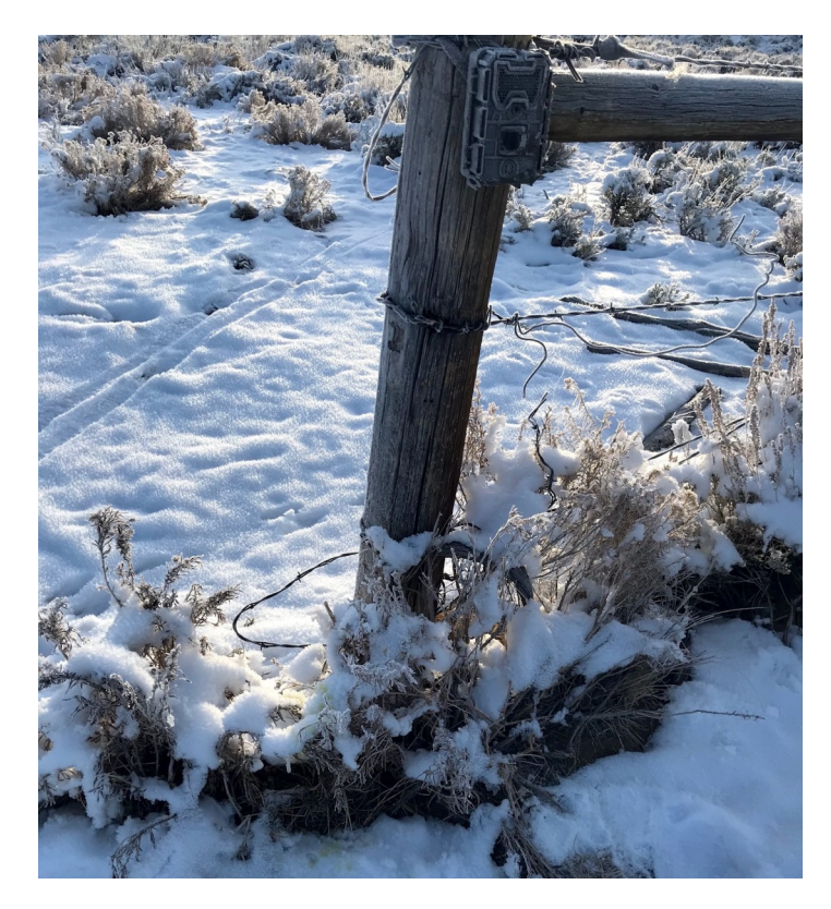
Figure 11. Motion-activated trail/game camera set up to capture images of animals at a scent mark.

The two most important features to look for in a remote trail camera are trigger speed and recovery time. Trigger speed is how fast the image is taken once motion is detected. It should be less than half a second. A fast trigger speed can be the difference between entirely missing an animal and recording the presence of an elusive carnivore. The recovery time is how fast the camera resets before taking the next image. It should be less than a second.