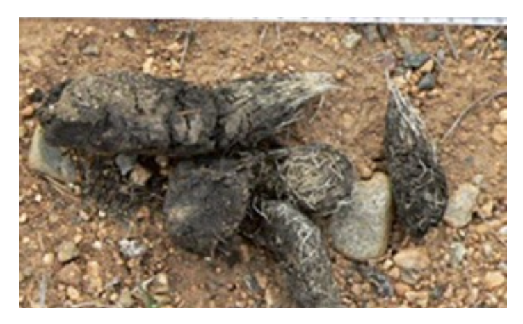
Figure 6. Gray wolf scat.

Domestic dogs will naturally seek out and urinate in spots previously marked by wild predators. If the situation allows, bring along a dog and allow it to find canine scent marks along ranch roads or trails. If the dog shows an interest and urinates in an area, mark that location and monitor it for wolf sign.