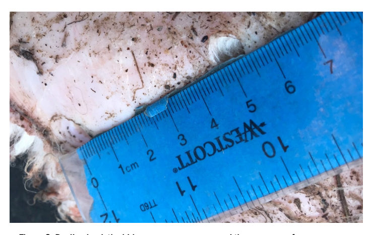
Figure 8. Peeling back the hide on a carcass can reveal the presence of canine bite marks. Measuring the distance between the puncture wounds can aid in identification of the species responsible.

Signs of a struggle, such as sprayed blood, torn-up ground, and trampling indicates a possible depredation, so check