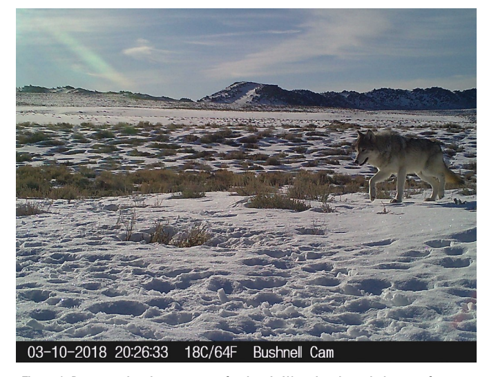
Figure 1. Documenting the presence of wolves in Wyoming through the use of a camera trap (above) . These and other simple methods provide information that can be used to help prevent or minimize wolf depredations.

Livestock Producer Sublette County, Wyoming