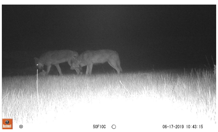
Figure 10. Camera traps at draw stations can confirm the presence of gray wolves in an area.

for predator bite mark measurements). The collection of blood around the bite marks (i.e., hemorrhaging) indicates the prey was alive at the time of the bite (Figure 9). Search for other signs by walking in expanding circles around the depredation site looking for tracks, scat, carcass parts, feeding location, and other clues. Multiple species may visit and scavenge the carcass, so confusing signs of more than one predator species is possible.