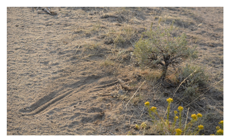
Figure 7. "Scratch-up" or scratches on the ground may indicate an area where a gray wolf left a scent mark.

determine whether the animal was killed by a predator or scavenged. Assistance with or guidance on how best to conduct a carcass investigation may be available from state fish and game agencies or the U.S. Department of Agriculture's Wildlife Services program.