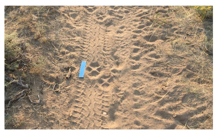
Figure 3. Wolf tracks are often in a single narrow line, with the track of the hind foot placed within or in front of the forefoot.

To prepare the plaster mixture, fill a plastic cup about half full of water, and while stirring, add the plaster (about 2 parts plaster to 1-part water), mixing well. The mixture will start to thicken and should be fluid, but not runny, when poured carefully into and over the track. Protect the track while the plaster sets; place a bucket over the track and leave it for a few hours before carefully removing it from the ground with a spatula or shovel and leave it in a safe place to dry for a day or two.